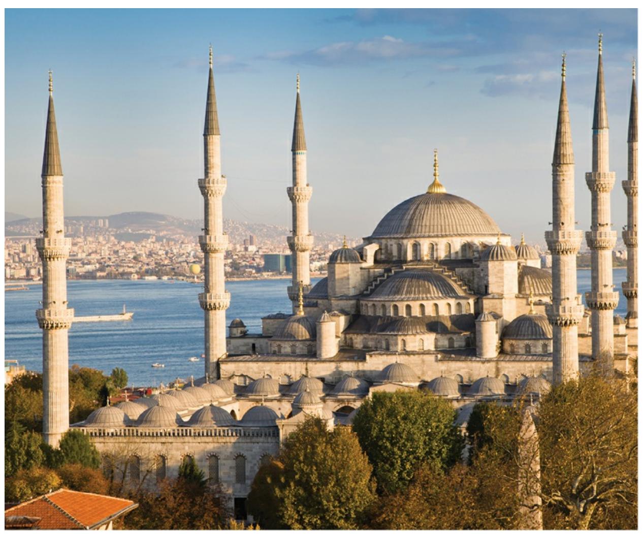
The Blue Mosque, Istanbul. Highly unusual because of its six minarets (rather than the usual four), this is an outstanding example of Islamic art and architecture.